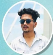
KVRS TEJA (ME IV/IV)